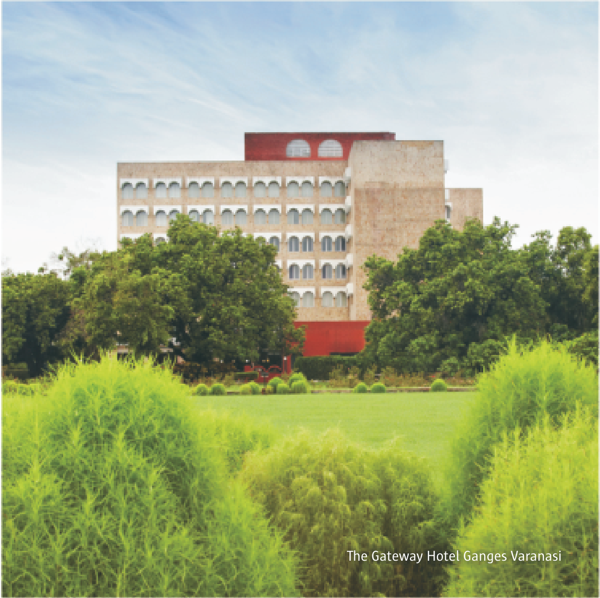
The Gateway Hotel Ganges Varanasi