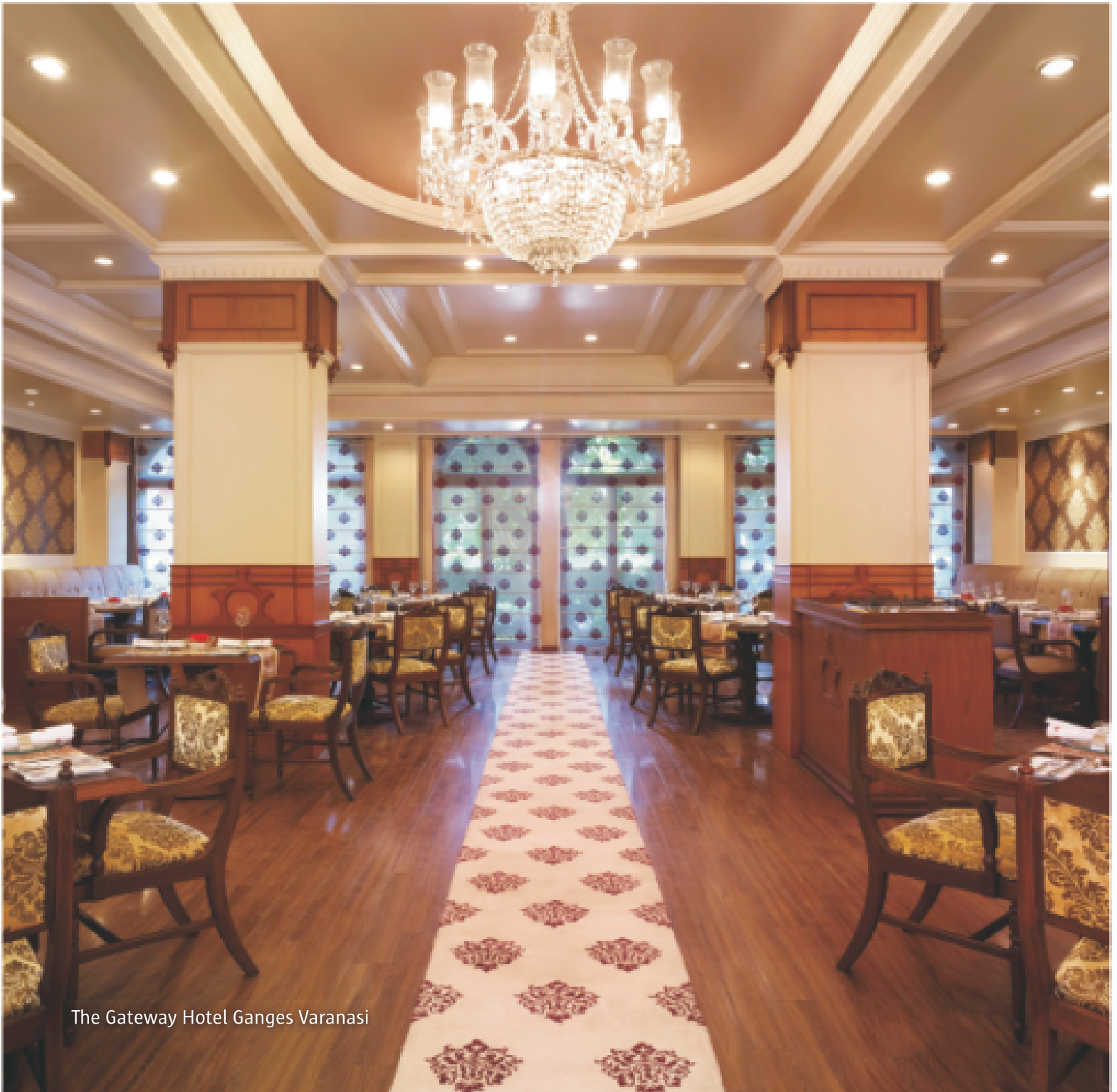
The Gateway Hotel Ganges Varanasi