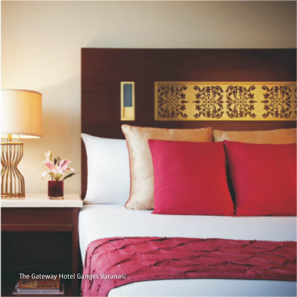
The Gateway Hotel Ganges Varanasi